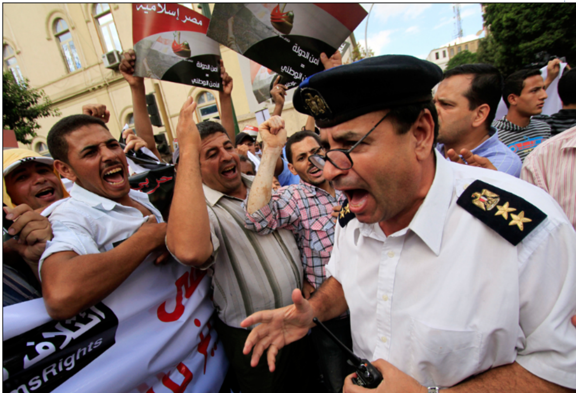
16 An Egyptian police officer joins demonstrators in chanting slogans during a protest in Cairo on Sept. 23. Holding posters that read, in Arabic, "Islamic Egypt," a group of Salafi Muslims protest emergency laws in front of the interior ministry. Salafis, who had not been politically active before the ouster of Hosni Mubarak as president, insist upon a government built upon Islamic laws. #